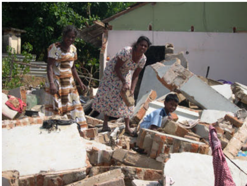
Clearing rubble by hand. It didn't used to be called rubble. It used to be called home.